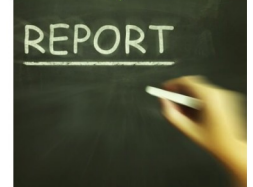
Report of Findings

By law, Medicare patients are not eligible for this offer.